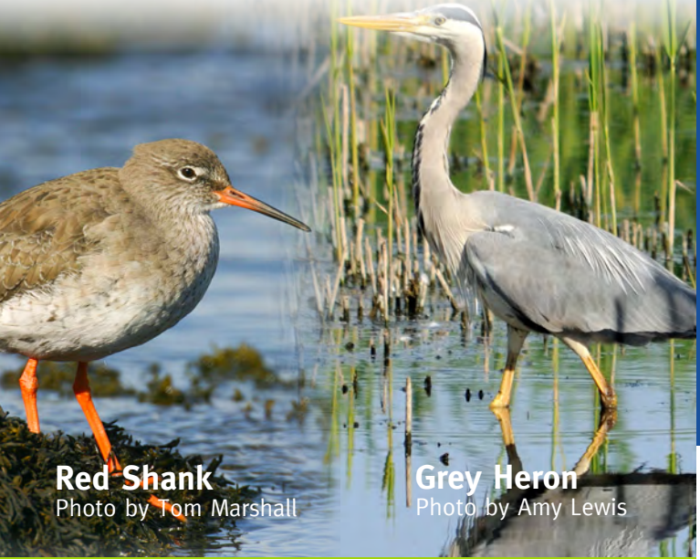
Red Shank

More information about Blue House Farm and the other nature reserves can be found on the Essex Wildlife Trust's website www.essexwt.org.uk .