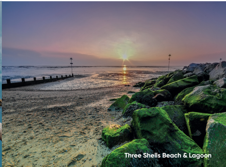
Three Shells Beach & Lagoon