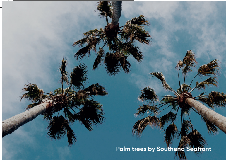
Palm trees by Southend Seafront