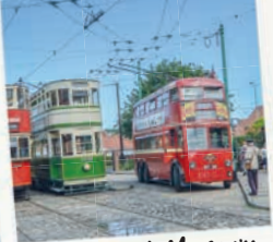
Transport Museum Carlton Colville