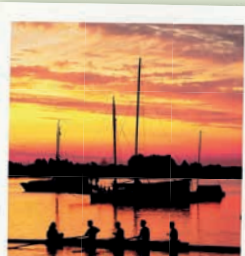
Oulton Broad Sunset