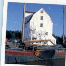
Woodbridge Tide Mill