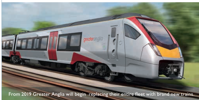
From 2019 Greater Anglia will begin replacing their entire fleet with brand new trains.

More than fifty years later, both lines are thriving with trains running hourly seven days per week Ipswich – Felixstowe and hourly Monday to Saturday Ipswich – Lowestoft (with a good Sunday service in operation too).