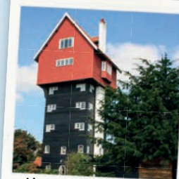
House in the Clouds Thorpeness

The County Town of Ipswich boasts a large retail centre, parks, theatres, cinemas, museums and, just a few minutes from the station, Portman Road, home of Ipswich Town Football Club. One of England's oldest towns, painter Thomas Gainsborough resided and worked in Ipswich and in 1800 Lord Nelson was appointed High Steward. Today the waterfront features a host of historic and contemporary buildings along with hotels, restaurants and a busy marina. Museums in the town include Ipswich Transport Museum, Christchurch Mansion and Ipswich Museum.